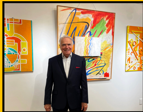
Designer / Painter / Photographer