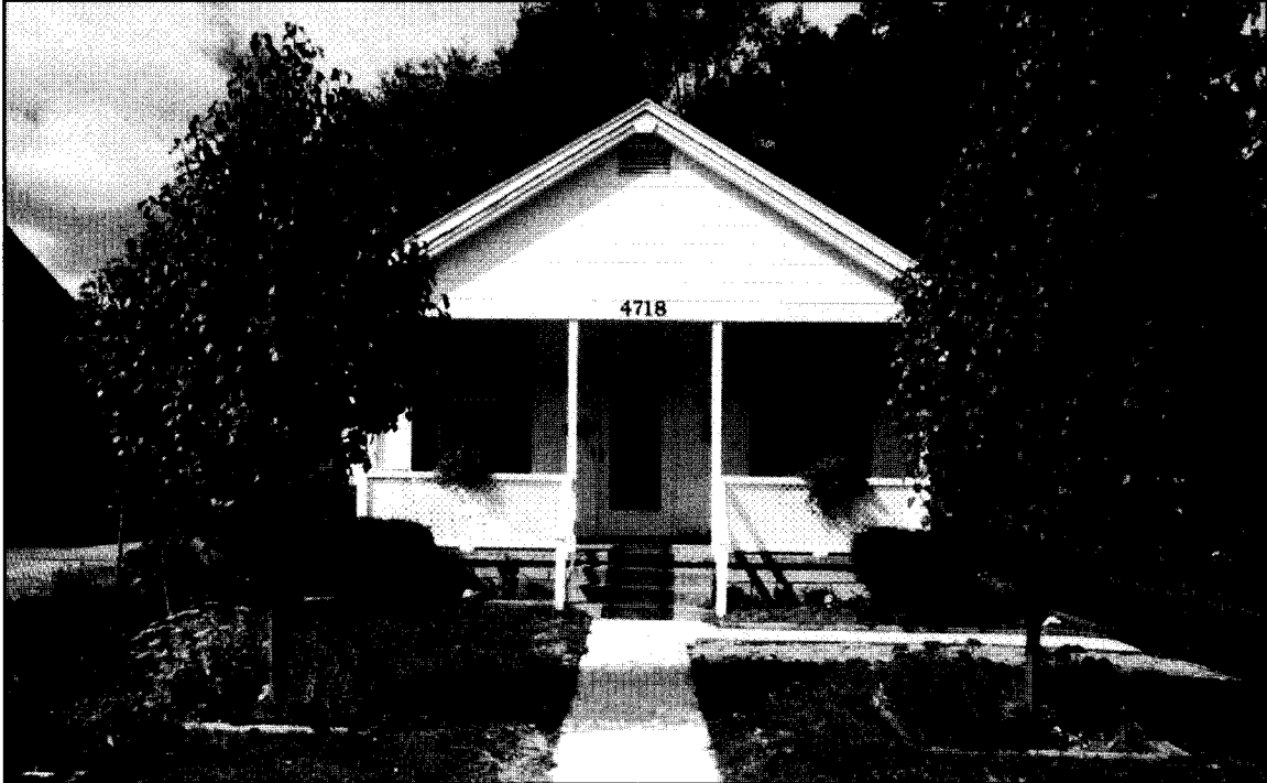
United Brethren Church

Located near 47th and Canterbury Streets, this is the original church building of what is now the United Methodist Church. It was constructed about 1912. It is now occupied as a residence.