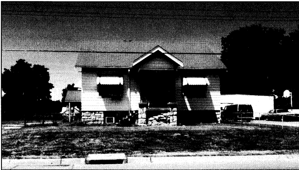
United Brethren Church

Located near 47th and Canterbury Streets, this is the original church building of what is now the United Methodist Church. It was constructed about 1912. It is now occupied as a residence.